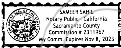
Place Notary Seal and/or Stamp Above

Signature Sameer Sahil Signature of Notary Public