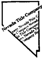
EXHIBIT 'A' ===== LEGAL DESCRIPTION =====

Lots numbered Three (3), Five (5), Seven (7) and Nine (9) in Block "A" of the Denton Heights Addition to the city of Caliente, County of Lincoln, State of Nevada.