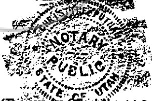
(This area for Official Notarial Seal)